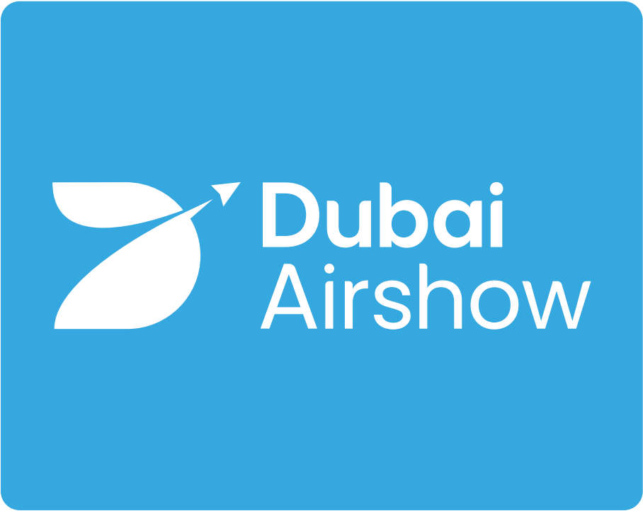
Master Logo Reverse