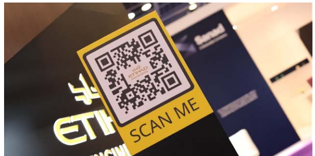
Contactless transactions are encouraged.