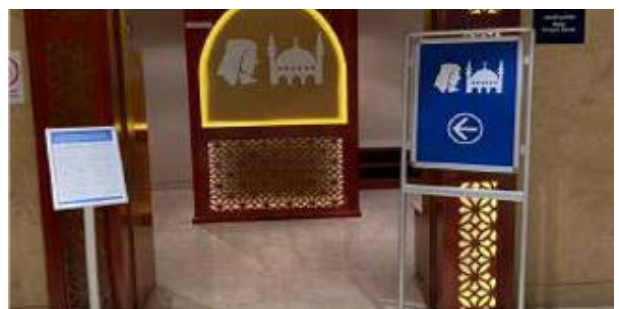
Prayer rooms will be open and follow federal guidelines.