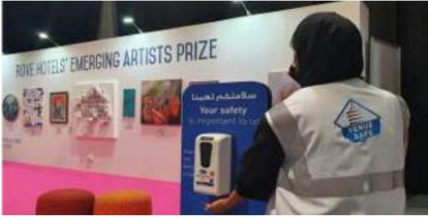
Santisers will be readily available at multiple locations.