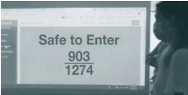
Real time monitoring of crowd density and venue capacity.