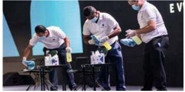
Disinfection protocols will be adhered to in all public areas, F&B outlets and restrooms.