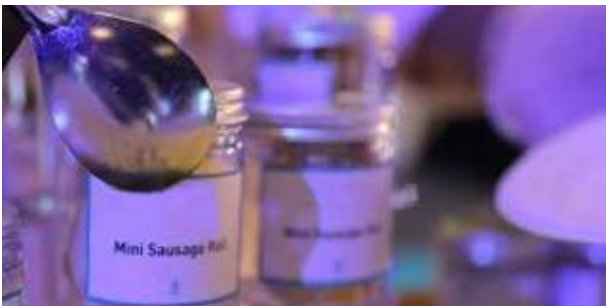
Only individually packaged food and beverage items will be available across all F&B outlets.

For any queries on health and safety measures, please contact us at info@dubaiairshow.aero