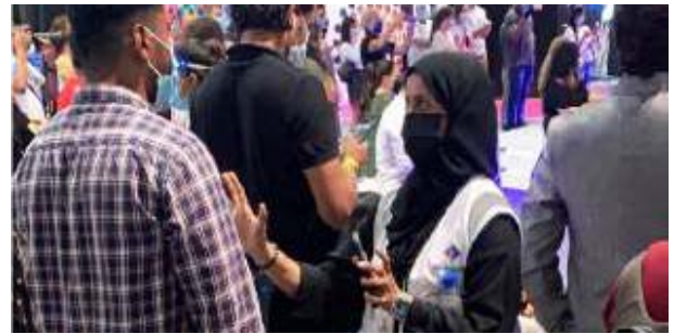
Trained safety wardens will monitor social distancing & wearing of masks throughout the event at all times.