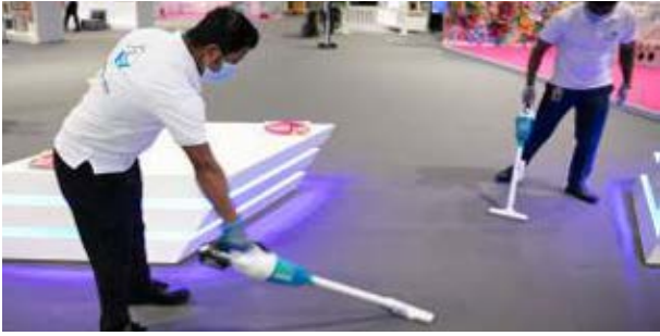
The exhibition hall + chalets will be thoroughly cleaned and sanitised after each show day.