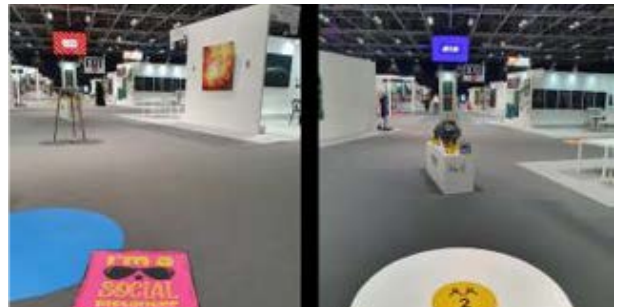
Aisles will be a minimum of 2.5 metres width for one-way traffic and 4 metres for two way traffic.