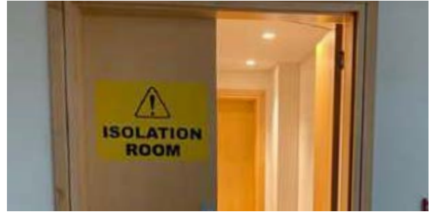
Isolation rooms will be set up at the venue for suspected cases and managed with Dubai Health Authority (DHA).