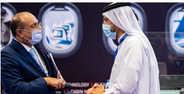
We encourage attendees to avoid shaking hands and exchanging business cards.