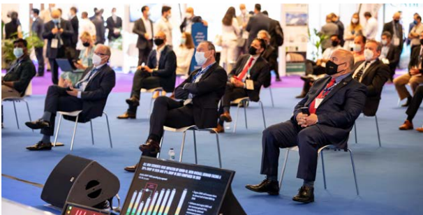
Conference chairs will be set 2 metres apart from each other at the conference.