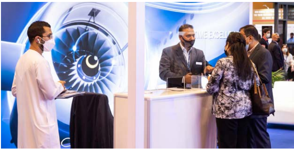
Exhibition stand maximum capacity and the minimum 2m social distancing guideline will be monitored and respected at all times.